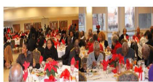
Dining & Celebration