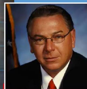
Mayor Micheal Bowdler