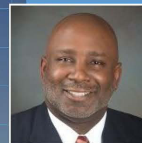
Mayor Byron Nolen