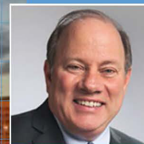
Mayor Mike Duggan