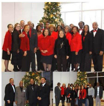
Family or Group Photos Available