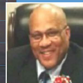
Mayor Lamar Tidwell