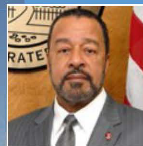
Mayor Hubert Yopp